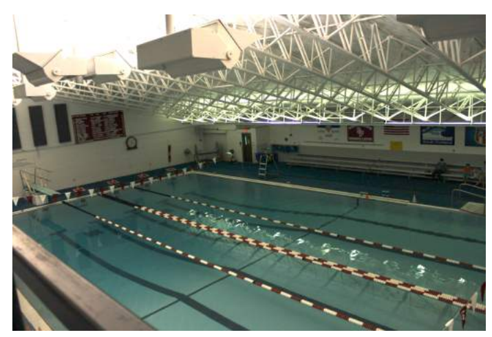
South Portland Pool

Respondents were asked how frequently they used the recreation facilities and amenities in Standish. The facilities that received the most use (one or more times per year) were the Mountain Division Trail (69.9%), Johnson Field (66.8%), and Rich Memorial Beach (54.8%). Facilities that were used by more than half of the respondents were School Playgrounds (52.5%). Table 5 below shows the breakdown of recreation facility use in Standish by survey respondents.